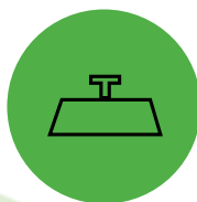
Products \leq 500 \text{ kg/m}^3