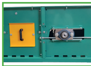
Band tension adjustment